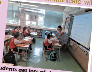
Students get lots of chance to practice speaking with their peers during lessons.