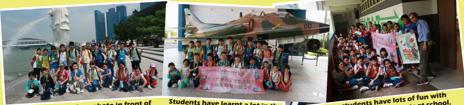
Students take a photo in front of the Merlion Statue at Merlion Park.

Every year, students find the experience to be extremely enjoyable and rewarding as they have the opportunity to travel to different places, improve their English language skills and also to become more independent.