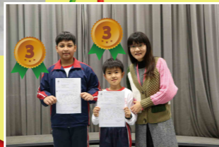
Congratulations to all the winners and their training teachers. Their endeavours made a success in the end!