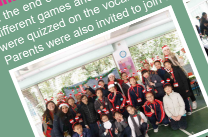
English ambassadors help conducting the games for students with the NETs.

At the end of December, we invited a team of NETs to host a special Christmas themed event at our school. The NETs designed seven different games and came to the school on the day to play them with the students. The games were conducted in English and the students were quizzed on the vocabulary they have learned throughout the year, whilst also providing a lot of fun and festive cheer for the students. Parents were also invited to join the games and gained an insight into what their children learn at school.