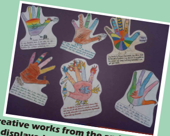
Creative works from the ambassadors are displayed everywhere in the campus.

Our NETs coordinate with local teachers to hold different kinds of training activities for P.4-P.6 elite students after school every Tuesday and Thursday. Students are trained as English ambassadors to carry out school activities and promote English at school throughout the year.