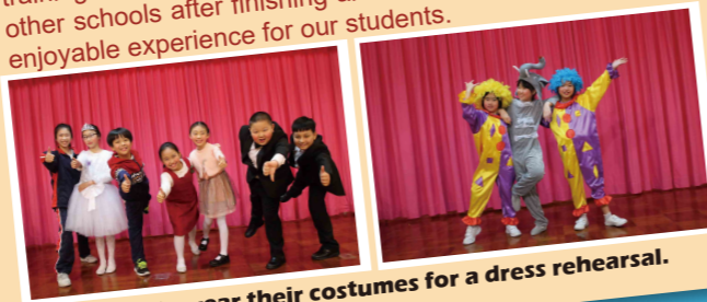
Students wear their costumes for a dress rehearsal.

A professional drama teacher is hired to hold English drama training at our school. During the training, students are engaged in different characters and perform their part individually and also together as a team. Students learn how to collaborate and build good team spirit through participating in the drama training. They will also enter the drama festival competing with other schools after finishing all training. It is a challenging and enjoyable experience for our students.