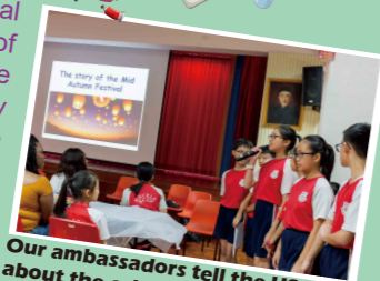
Our ambassadors tell the US Navy about the origin of Mid-Autumn Festival.