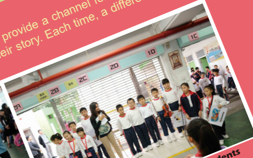
Miss Sonali invites some P.4 students to share their hobbies.