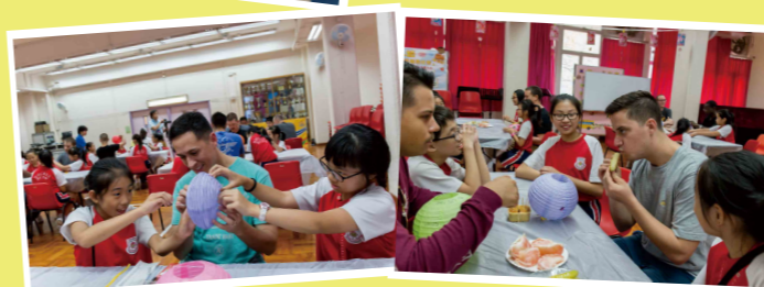
The US Navy enjoy making traditional lanterns and delicious special food.