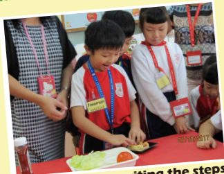
Students practice writing the steps of making a hot dog authentically in lesson.

Our school has implemented the PLP-R/W for P.1-P.3 since 2008 in order to enhance students' literacy skills through a variety of reading and writing activities. This program also helps to develop students' phonological awareness. Moreover, it provides students with focused support through small group teaching. The home reading program which is included in the PLP-R/W has fostered the students' independence and motivation in learning to read and reading to learn. It also promotes and supports the creation of a home environment that will encourage students to become interested in reading English at home.