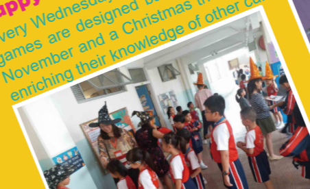
NETs and local teachers play Halloween games with students in the corridor.

Every Wednesday and Thursday, our NETs organize and design games for students to play during the school recess. The games are designed to encourage students to speak English, whilst November and a Christmas theme in December. For example, a Halloween theme in October, a Thanksgiving theme in November and a Christmas theme in December. The games are designed to encourage students to speak English, whilst