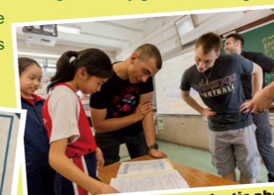
Our students are enthusiastic about chatting with the US Navy at recess.

On 4th October, 2017, 25 members of the US Navy visited our school. The sailors came from the biggest ship in the US Navy fleet, called the USS Ronald Regan. We enjoyed three hours of exciting activities together including; playing dodgeball, Mid-Autumn Festival lantern making and food sharing. Students also had a chance to interview the sailors in English. They gained an insight into the lives and jobs of the sailors – something that is not taught in the textbooks.