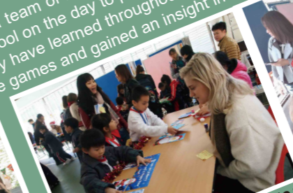
Students have a chance to meet up and speak English with NETs from outside.