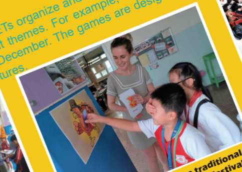
Students participate in a traditional game during Thanksgiving Festival.