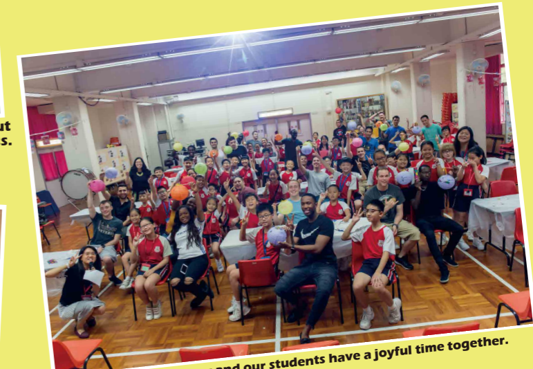
Both the US Navy and our students have a joyful time together.