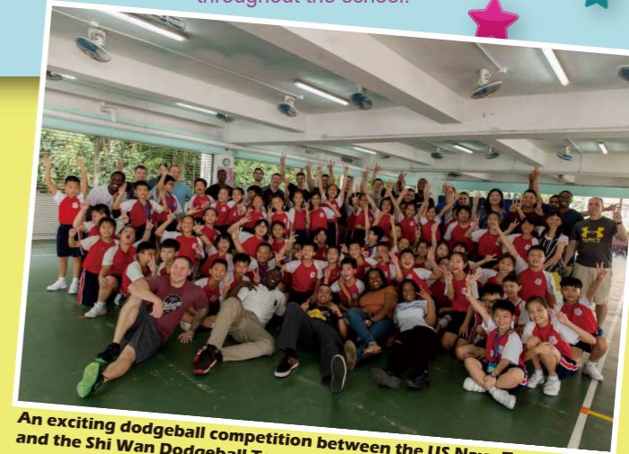
An exciting dodgeball competition between the US Navy Team and the Shi Wan Dodgeball Team.